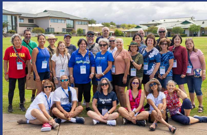
KS class of 1974 visited the KSM campus in Oct '24.