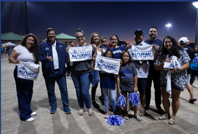
KSM class of 2006 at KSM Homecoming